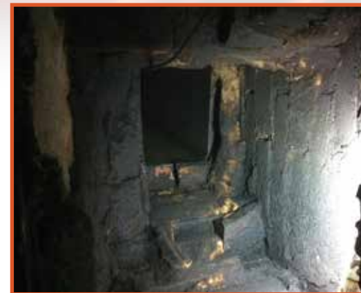
Exposed Brick Before Chamber Coat Application